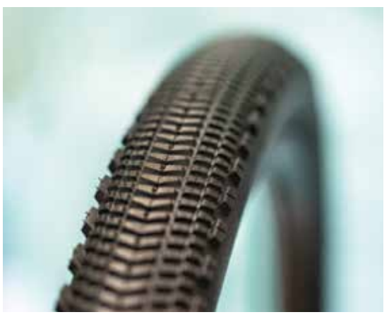
Long-lasting and robust: The new G-One Overland is the long-distance specialist.

Yet another new tire for riding gravel: The G-One Overland of the Evolution line. On long tours or long-distance races, its riders benefit from an easy roll center line, stable shoulder knobs and a robust Super Ground construction (also suitable for Tubeless Easy). Here, the main focus is on durability. It is ideal for gravel e-bikes that are hard on the tire due