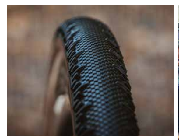
Fastest tire in Schwalbe's gravel portfolio: The new G-One RS

What the Pro One is within the road tire segment, is the new G-One RS for the gravel series: The showpiece of the Evolution line. The letters RS mean Race Speed and all features are designed for speed on dry, hard surfaces. Yet, it easily handles wet weather conditions, as proven by this year's win at the Unbound Gravel. The Super Race carcass, analogue to the road tire Pro One, has two layers beneath the tread ensuring low rolling resistance, and it provides a lot of grip and comfort thanks to its enormous flexibility. Three carcass plies along the side reliably protect from cuts and pinch flats, while the V-Guard underneath the tread offers outstanding puncture protection. The three-layered side material also prevents the tire from collapsing (burping) while cornering.