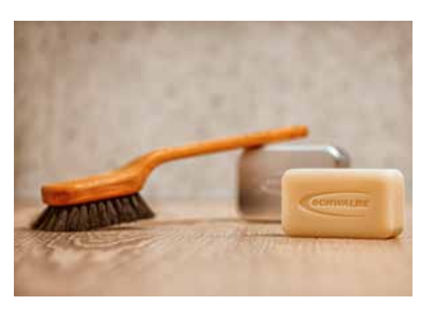
A bar of soap instead of plastic bottles: Schwalbe Bike Soap is fully biodegradable - and much more economical than liquid soap.