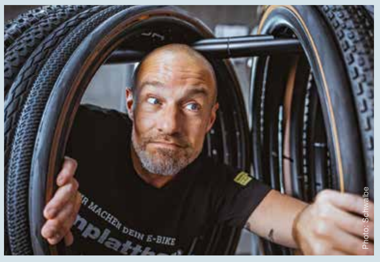
Which tire is the best for me? The new online tire consultant is the guide through the jungle of tires.