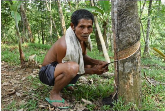
World market prices for rubber are below production costs. Via Fair Rubber, the small farm cooperative in Indonesia receives a monthly premium from Schwalbe.