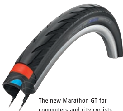
The new Marathon GT for commuters and city cyclists.

The Marathon GT is in the middle range of the Marathon trio when it comes to both its technical specifications and price. In order to achieve a high, light-rolling puncture protection, Schwalbe developed an innovative "double puncture protection" system consisting of two components – the DualGuard.