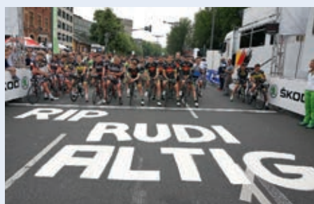
The race was dominated by the memory of Rudi Altig, who had died just the day before the race.

During the two-day celebration of cycling in the Rheinauhafen harbour in Cologne,