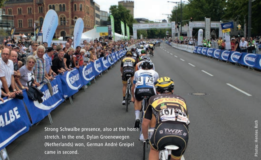
Strong Schwalbe presence, also at the home stretch. In the end, Dylan Groenewegen (Netherlands) won, German André Greipel came in second.