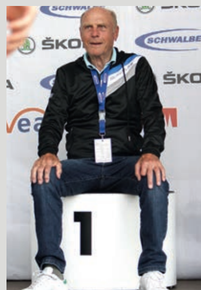
Rudi Altig as race director and Schwalbe ambassador at the 99. edition of the cycling event “Rund um Köln” in 2015.