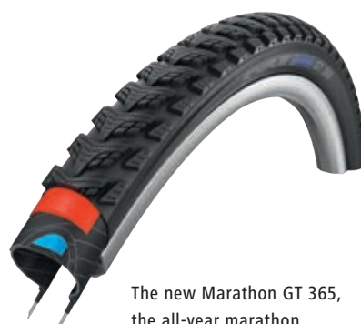
The new Marathon GT 365, the all-year marathon.