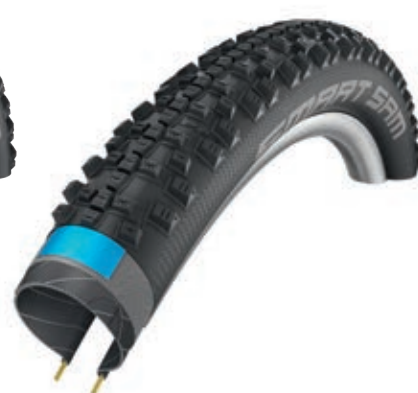
Smart Sam with a new profile design, also available in Performance DD.