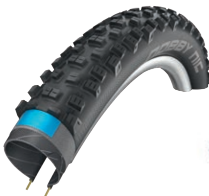
Nobby Nic in Performance DD with new silica compound.