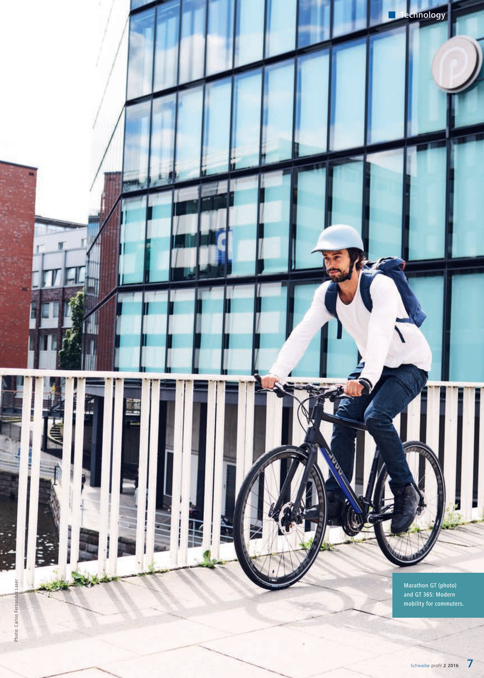
Marathon GT (photo) and GT 365: Modern mobility for commuters.