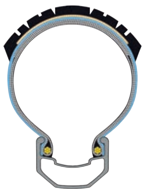
Performance DD: All around SnakeSkin and RaceGuard under the tread.

That's perfect: The trend towards wider tires and the 27.5+ size have come along just at the right time for the e-MTB. "The bikes often have a thicker frame and also have to carry a motor and battery. This means that the plus tires are not only a perfect match for the e-MTB in terms of the look,